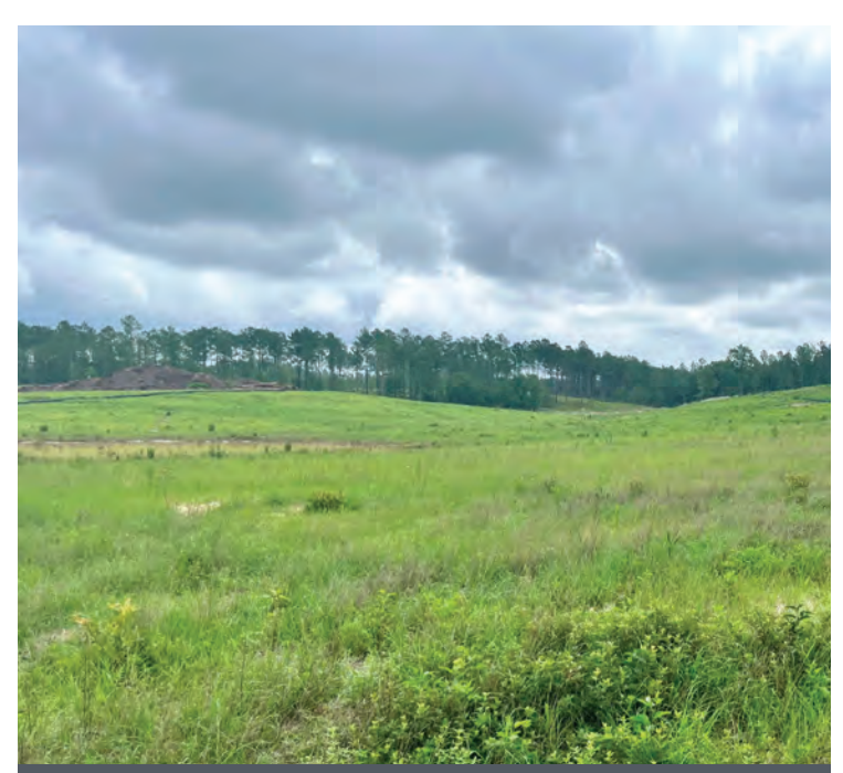
What will be the 8th tee box

He moved to the U.S., realized clubs were a terrific way to grow friendships and networks while having fun, and joined a few as he moved around the country. "I never bought homes,